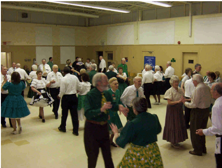
F2010 St. Patrick's Square Dancing

The FESTIVAL 2010 Web-page is up and ready for the world-wide square dance community to visit at www.squaredance.ns Click on the numbers 2010 in the upper right corner of the first page.