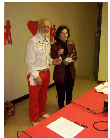
Valley Donation to H&S Foundation