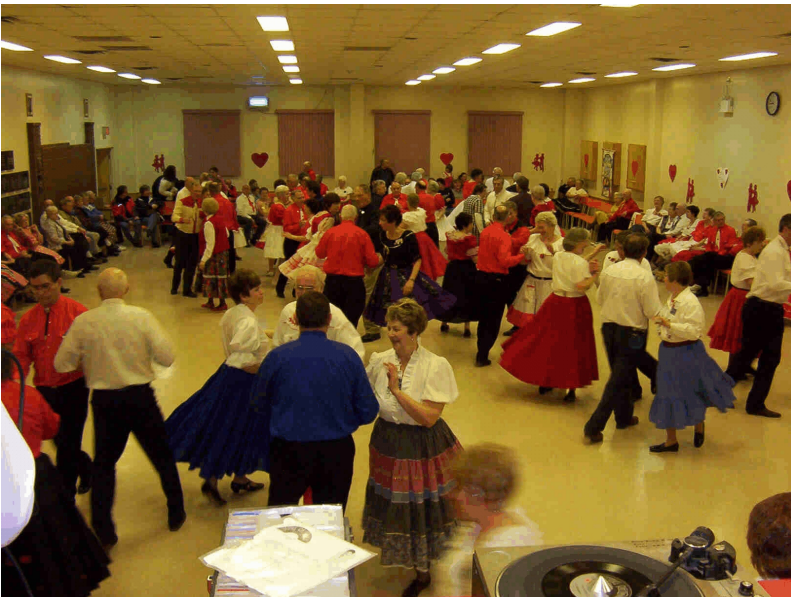
Valley Dance for Heart