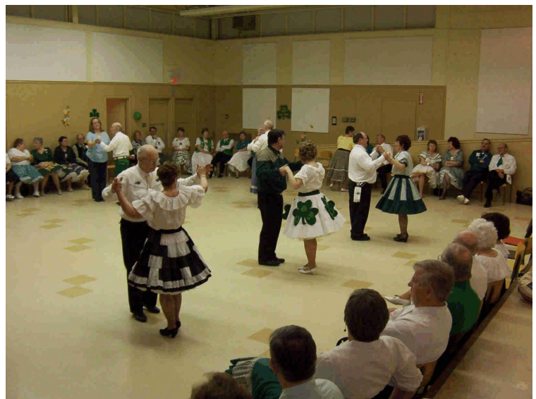
F2010 St. Patrick's Round Dancing